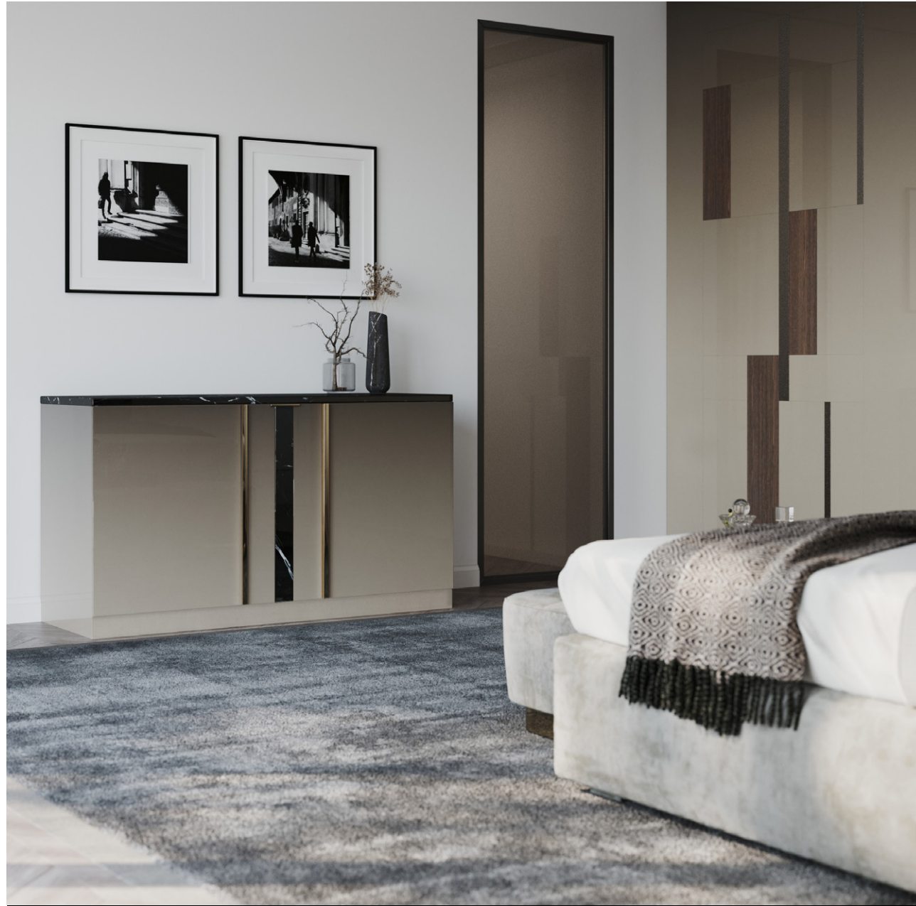
Closet & Bishop view